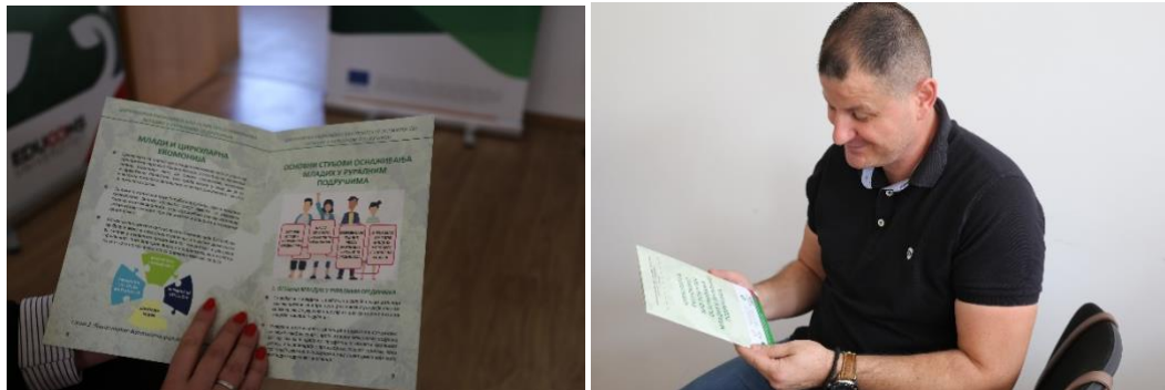
Figure 5. Educational and informative brochure: "Circular economy as a driver of youth empowerment in rural areas". Dragan Milojević, director of the Boljevac travel agency, looks at the brochure.